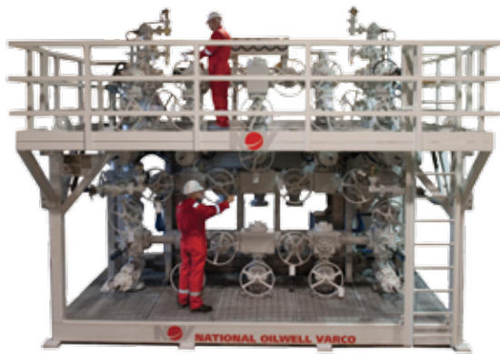
Choke and Kill Manifold