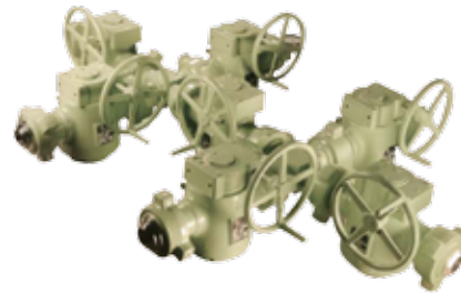
3" Fig. 1502 10,000 psi Cement Manifold